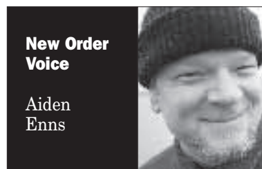
New Order Voice

In this time when we are over-saturated with words, action is critical. So, I'm working on my integrity, trying to bring my actions closer to my ideals. I know this can sound heavy-handed. Self-righteous even. But I didn't take the bus to be a saint or to alleviate guilt. I'm in the middle of an