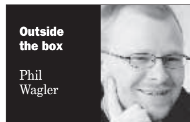
Outside the box

We each come sick, messy, broken, unclean and unrighteous, but we are declared righteous, not guilty, washed and healed in the sight of God because of the mess of Good Friday. Then we rise to a new life in the Spirit as children of God, and