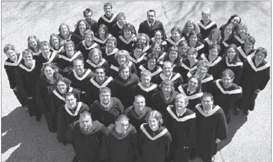
CMU graduates of 2004 gather for a group photo during commencement weekend.

Jeremiah meant that “life is a journey that can be invigorated when it relives the old in creative ways,”