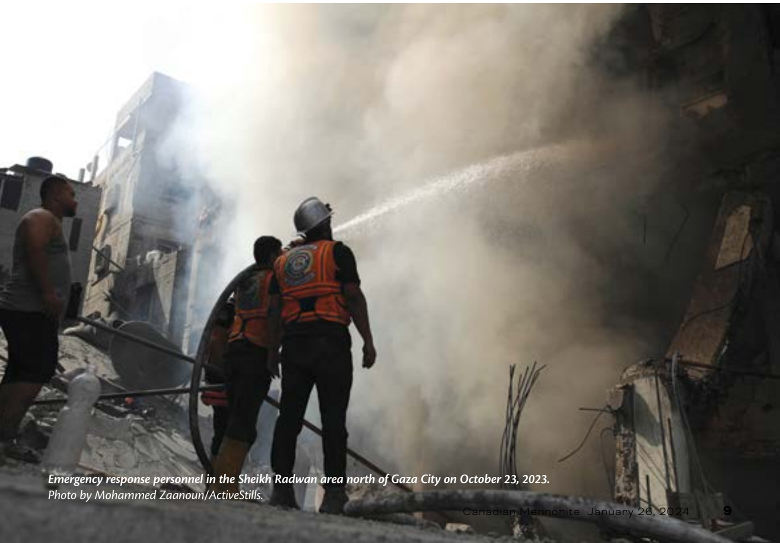
Emergency response personnel in the Sheikh Radwan area north of Gaza City on October 23, 2023.

Is the work of peace not always the work of nurturing in ourselves and those around us the uncommon capacity to truly see everyone as a child of God? Is that not part of what it means to wrestle with principalities and powers (Ephesians 6)? Can true peacemaking come from any other place? ☞