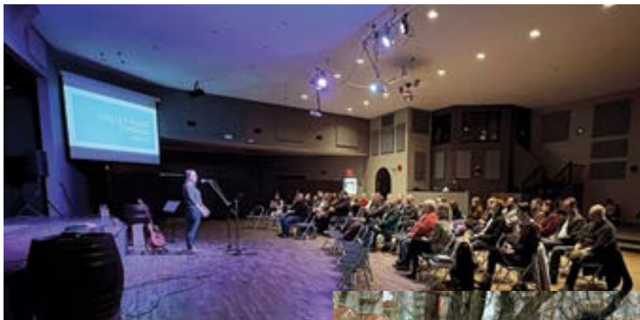
Valley Road Church.