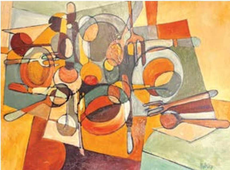
The exhibit includes this painting, titled “Dinner.”