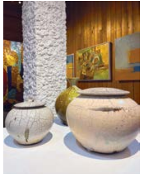
Raku pots by Alvin Pauls.