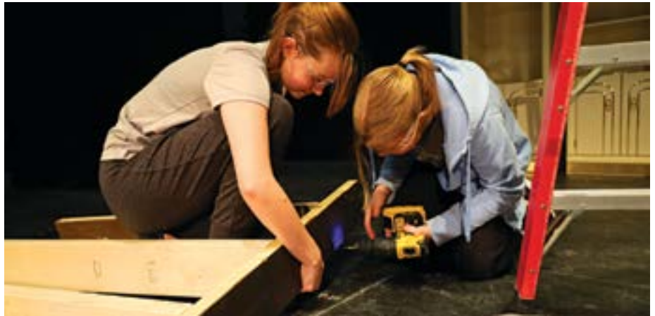
MCI students build a set they designed for a local drama production.

Workshop Wednesdays also gave opportunities for MCI to connect with the wider community. Students in the set design