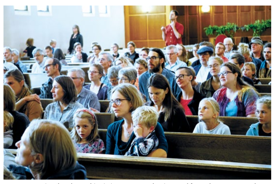
Hope Mennonite Church worships in its new space that is rented from Thomson Funeral Home.