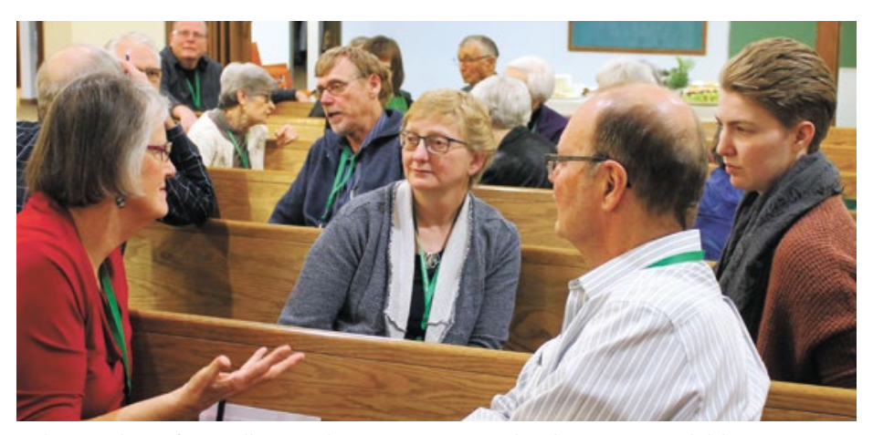
Delegates cluster for small-group discussions at MC Saskatchewan's annual delegate sessions, held at Zoar Mennonite Church in Waldheim.

The proposed changes represent a first draft. A final draft will be ready sometime this fall, so the MC Saskatchewan council can approve it prior to the delegate vote at