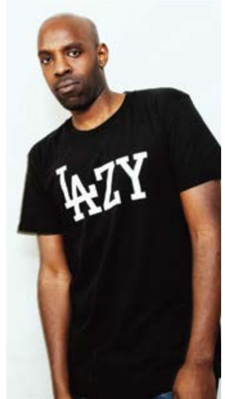
Vancouver-based hip-hop artist Shad weaves a social consciousness that is informed by his faith into his clever, deft rhymes.