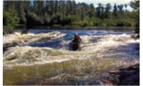
Northern Saskatchewan scenes from Churchill River Canoe Outfitters' excursions.